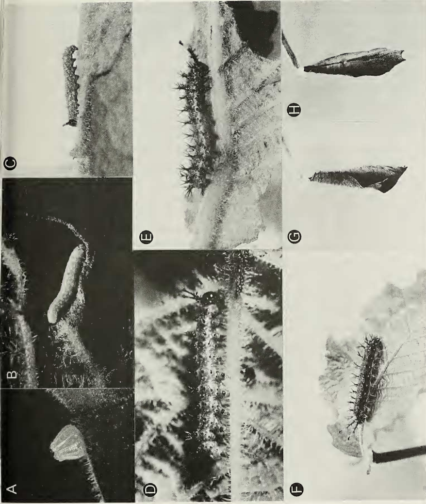
Figure 1. Immature stages of Eumica bechina . A, Egg. B, First instar larva. C, Second instar larva. D, Third instar larva. E, Fourth instar larva. F, Fifth instar larva. G, H, Pupa (lateral, ventral).